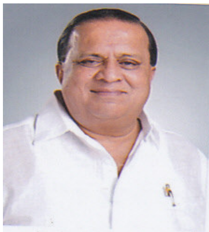
Shri. Hasan Mushrif Pro-Chancellor Minister of Medical Education