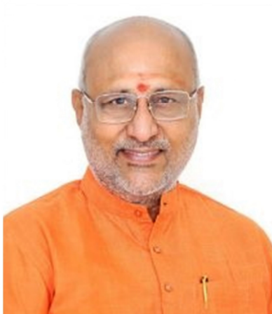
Hon'ble Shri C. P. Radhakrishnan